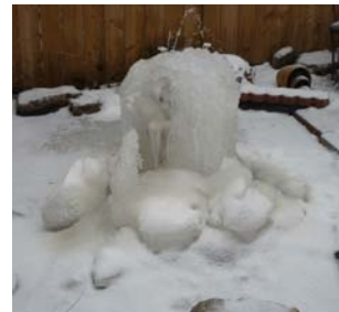
Frozen South Bend pond