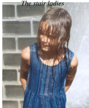
Wet Savannah in Chicago