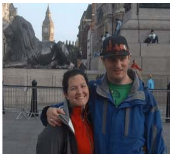
A quick visit to Trafalgar Square in September