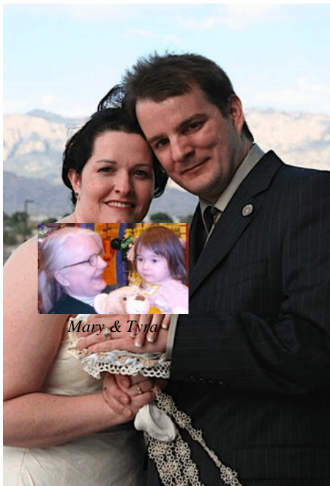
The Happy Couple