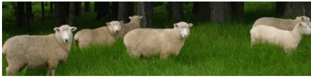
New Zealand sheep (a small fraction of them)