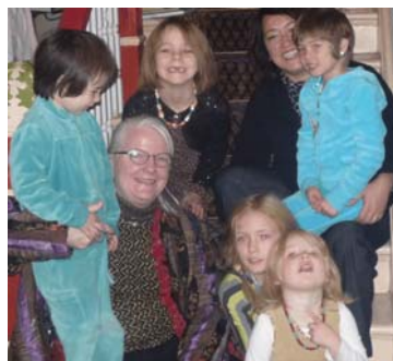
The stair ladies